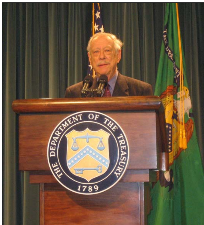
W. Michael Blumenthal addresses THA members at the 2006 Annual Meeting in the Treasury Media Room.

At the 2006 Annual Membership Meeting, the guest speaker was W. Michael Blumenthal, 64 th Secretary of the Treasury, serving the first half of President Carter's term. Secretary Blumenthal provided his remembrances of key events during his tenure as Secretary.