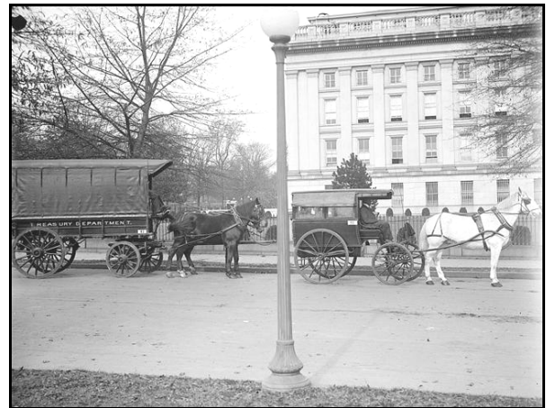
Early 20 th Century photo of Treasury Department wagons outside the Northwest corner of the Treasury Building, one of several photographic gifts to the Department of the Treasury from THA during 2008 and 2009.

In 2008 and 2009, THA also provided a number of gifts-in-kind to the Department in order to assist Treasury in continuing to expand its collection of historic images of the Treasury Building and Treasury-related persons. These included postcards, etchings, and photographs of the Treasury Building from the mid- to late 1800s throughout the twentieth century. Such vintage photographs have proven valuable to the Office of the Curator's research into architectural and façade treatment inside and outside of the Building, thus contributing to the authenticity of their efforts to restore the Building to its original historic appearance.