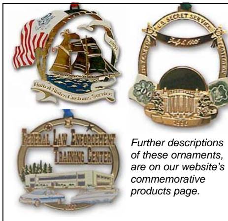
Further descriptions of these ornaments, are on our website's commemorative products page.

To order, use a copy of the form at left, and allow 2 weeks for delivery.